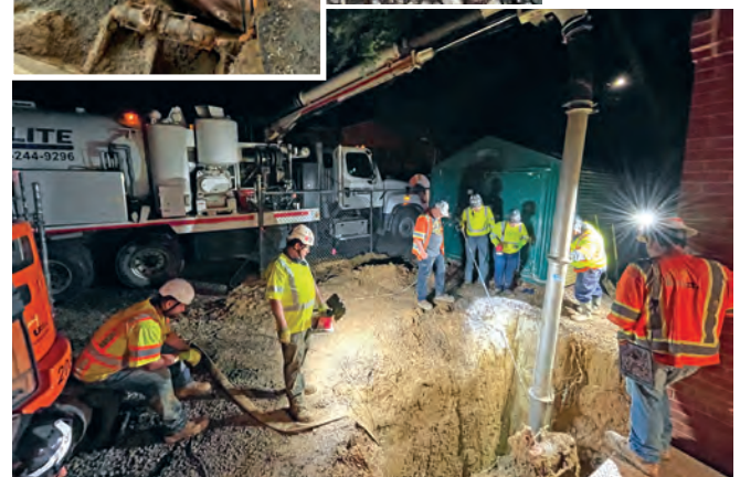
ABOVE: A vacuum truck removes wet sediment from the excavation site.

FAR LEFT: A trench box provides protection for workers. LEFT: The failed pipe segment was located and replaced.