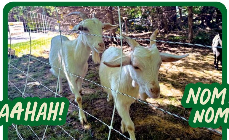
Twelve goats from Nostra Farm, including Bunny, Mater, Betty, McQueen, and Willie (the hungriest goat!), make quick work of invasive plants at Historic Blenheim.